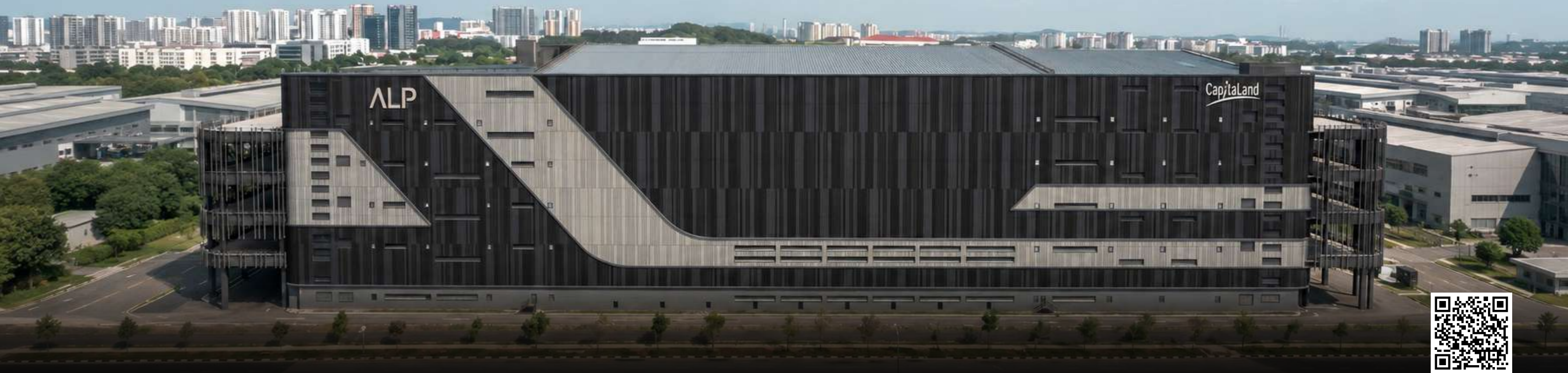
Flagship Multi-Temperature AS/RS Warehouse – Built for Regional and Cross-Border Logistics